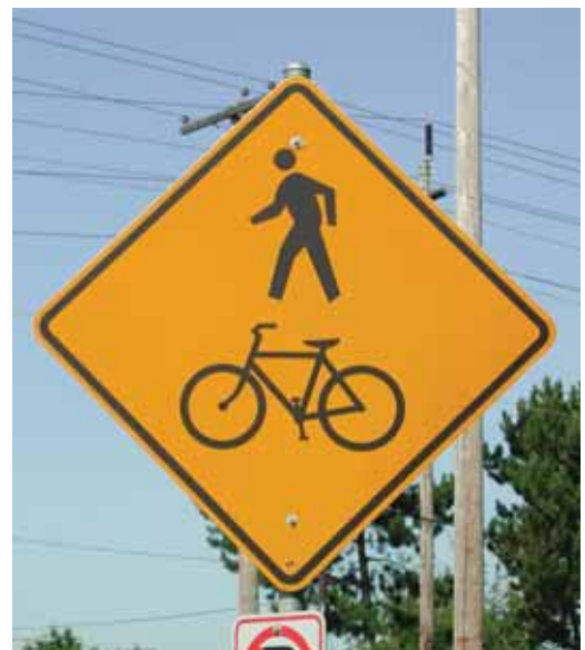
TRAIL CROSSING WARNING SIGN