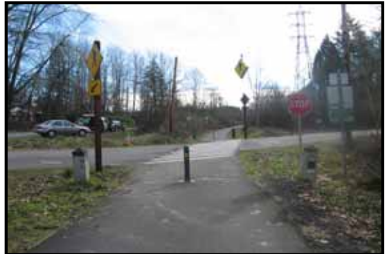
SAFETY IMPROVEMENTS AT ROAD CROSSINGS