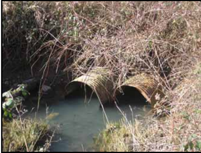
EXISTING CULVERTS MAY NEED REPLACEMENT