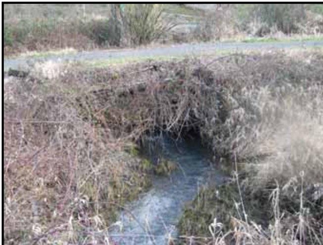
ENVIRONMENTAL CONCERNS INCLUDING EXISTING WETLANDS