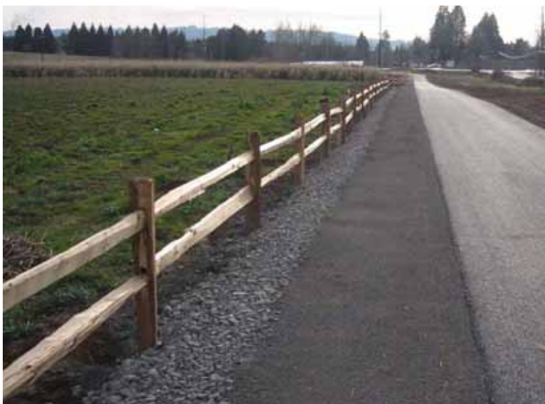
SPLIT RAIL FENCE AND EQUESTRIAN SHOULDER