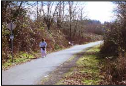
8' WIDE PAVED PATH 6' WIDE EQUESTRIAN SHOULDER