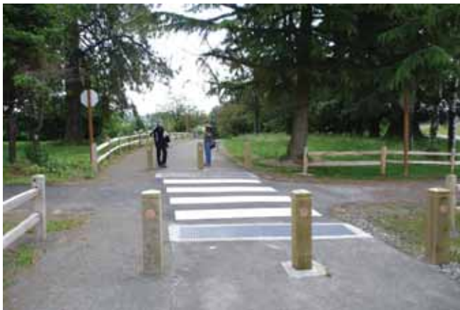
DRIVEWAY CROSSING WITH BOLLARDS AND TACTILE WARNING DEVICES