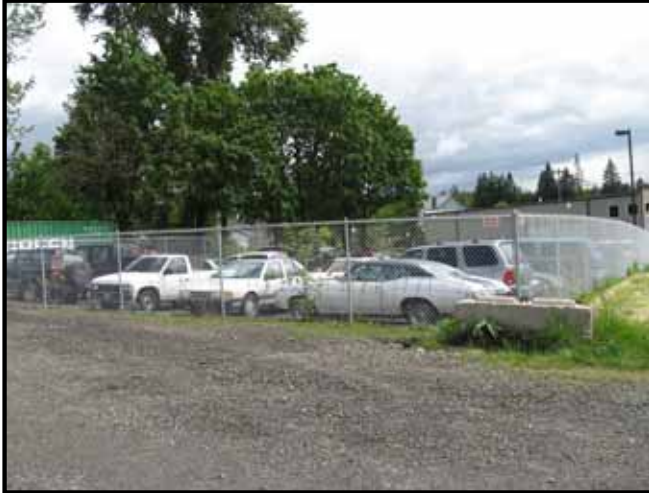
ADJACENT LAND USES