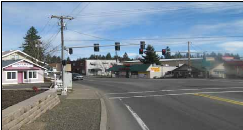
ADDRESS TRAIL CROSSING CONCERNS AT INTERSECTION WITH HIGHWAY 212