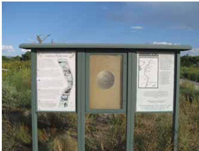
INFORMATION KIOSK WITH TRAIL REGULATIONS AND WAY-FINDING INFORMATION