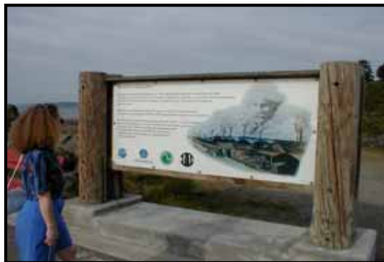
TRAILHEAD INTERPRETIVE SIGN