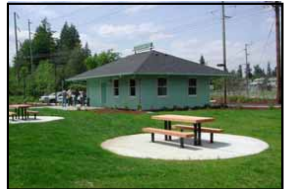
REPLICA STATION SHOWCASES RAIL HISTORY