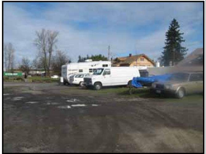
ADDRESS PARKING ISSUES