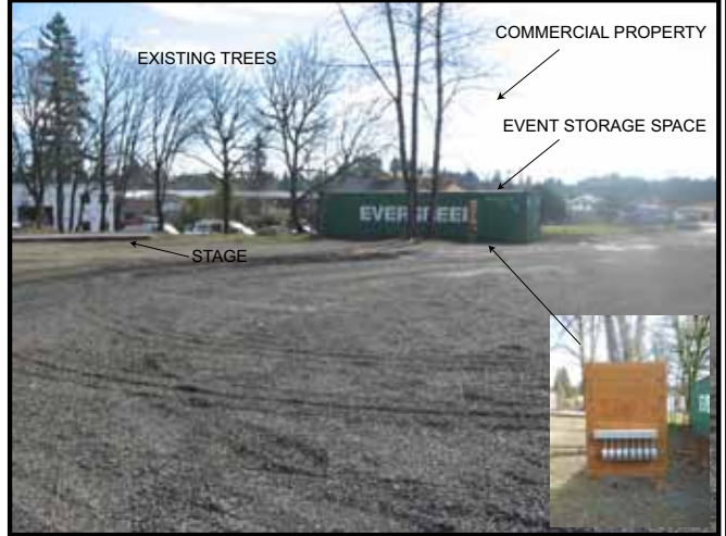
EXISTING SITE AMENITIES