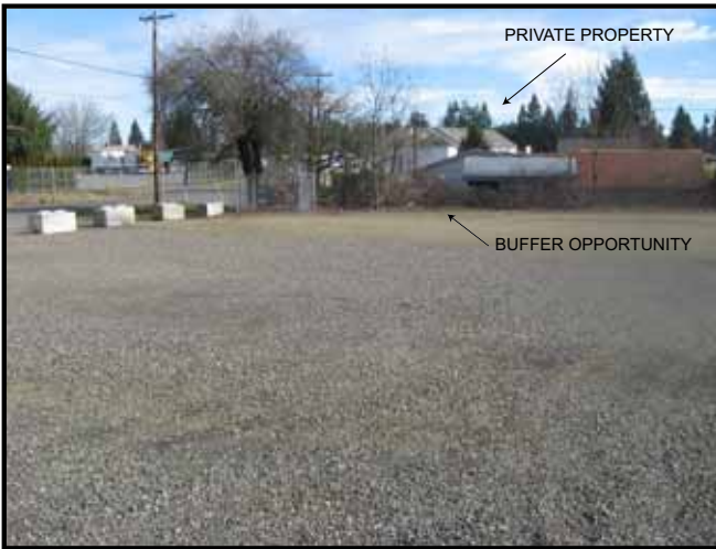
ADJACENT LAND USES