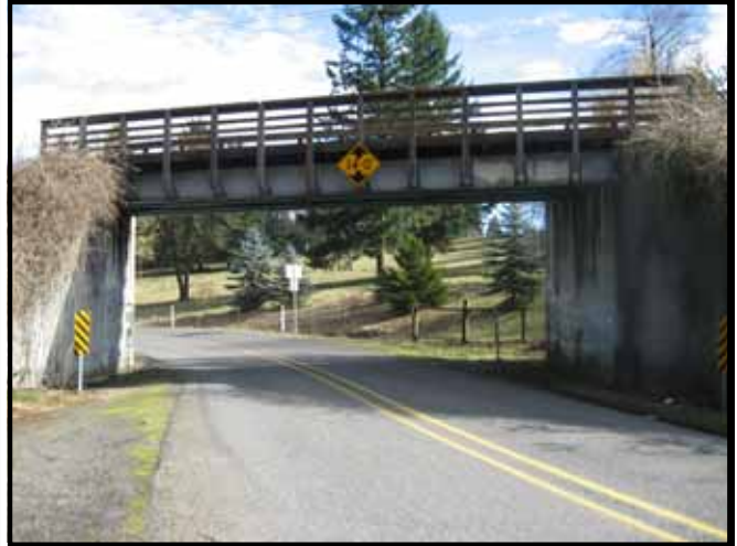
EVALUATE EXISTING BRIDGE OVER TELFORD RD