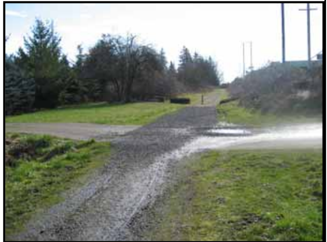
TRAIL CROSSING CONCERNS AT ROADWAYS AND DRIVEWAYS