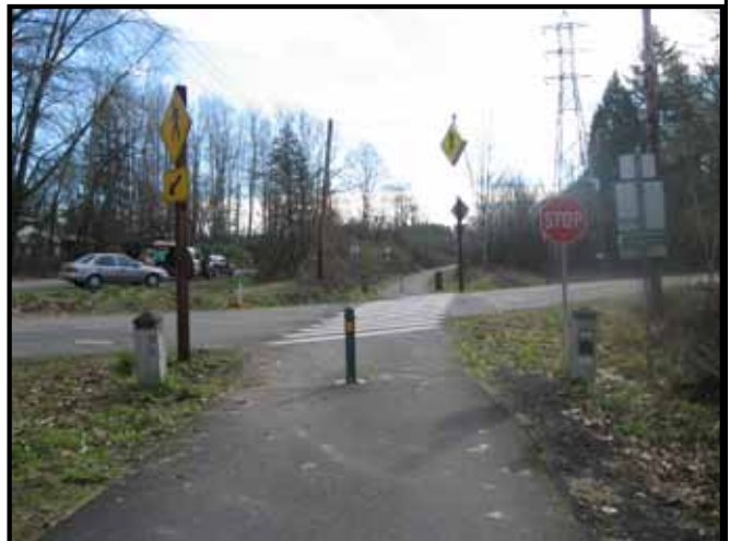
TRAIL CROSSING CONCERNS AT ROADWAYS AND DRIVEWAYS