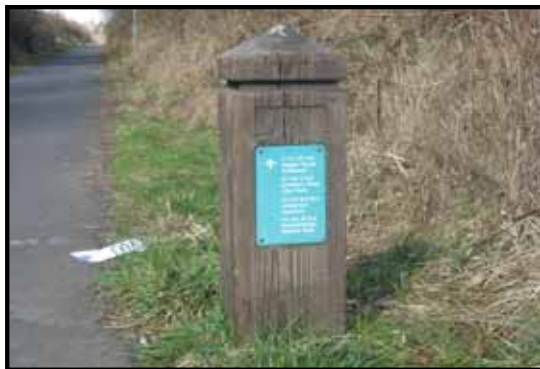
BOLLARD WITH WAYFINDING INFORMATION & MILEAGE