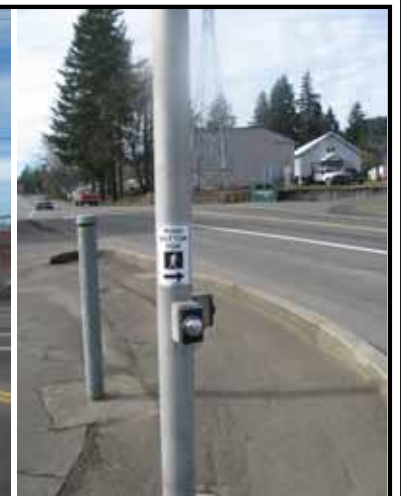
NEW SIGNALIZED CROSSING HWY 212