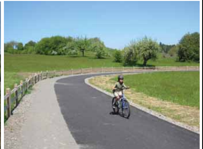
SPLIT RAIL FENCE & CRUSHER FINE SHOULDER FOR EQUESTRIANS