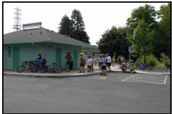
TRAILHEAD PARKING WITH RESTROOM FACILITY