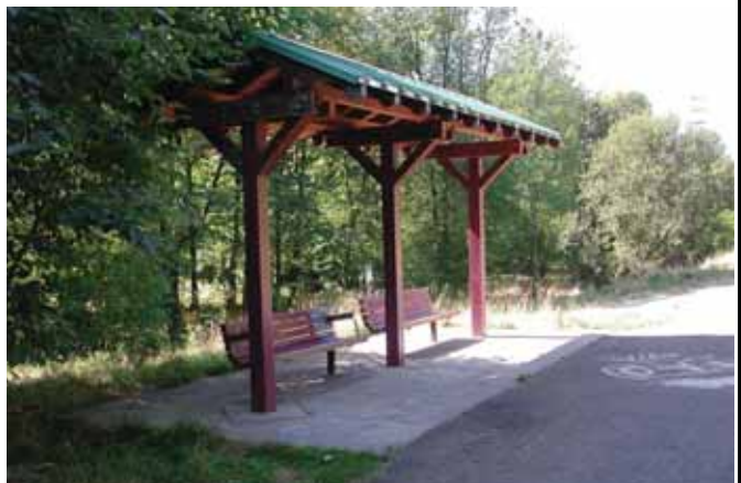
SHADE STRUCTURE WITH SEATING OPPORTUNITY