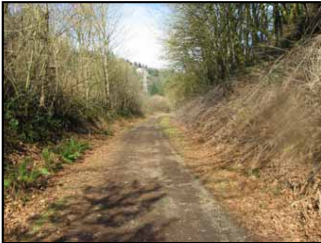
RIGHT-OF-WAY CONSTRAINED BY TOPOGRAPHY